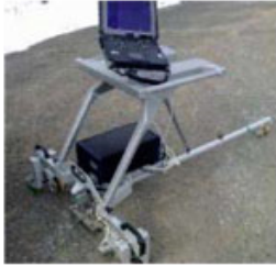
WPG 4 Type PLR